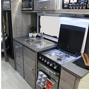
Space, luxury, comfort, the latest sustainable technology, with everything you need.